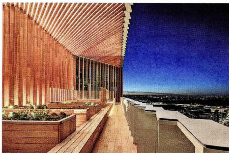
A Sky Garden at the Stratford. Below, the Hoxton, Southwark

SHOREDITCH 11 & ££ The latest addition to Soho House is one of its peachiest. It opened last autumn, and the decor's as sharp as a Harry Styles suit, but its affordability makes it relaxed. There's a branch of the group's popular trattoria-style Cecconi's restaurant, where you can tuck into sharing bowls of lobster spaghetti or, on Sundays, a lunch buffet of cicchetti, oysters, risottos, roasts and tiramisu. Breakfast is fruit, pastries and eggs any style. The 37 bedrooms are an ode to the 1960s and 1970s, with sizes ranging from Large to Tins – crash pads, really, though with a king-size bed and a rainforest shower. Doubles from £150; mains from £7; redchurchtownhouse.com