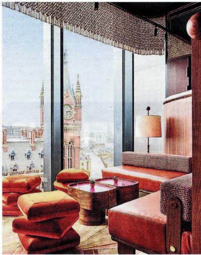
The view of St Pancras from Decimo, at the Standard. Bottom, the Belmond Cadogan

The Bingham, on a gentle bend of the Thames, was an artistic hub in the late 19th century, with visitors including John Ruskin and WB Yeats. In the 1980s, the Trinder family bought the pile, and it's now been given a magnificent refurb. The result is beautiful and homely: the 15 midcentury-modern bedrooms have copper baths and, in some cases, river views. Downstairs, there's an art-filled bar, a lounge lined with vintage paperbacks and a chandeliered dining room. The restaurant serves courgette risotto and lamb loin with goat's curd mash. Avocado is piled high on toast for breakfast. Doubles from £120; three-course dinner £45; binghamriverhouse.com