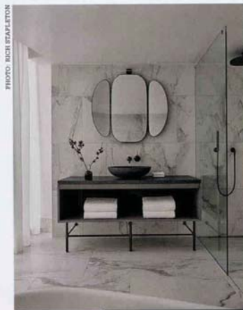
Space Copenhagen has created sophisticated, calming interiors