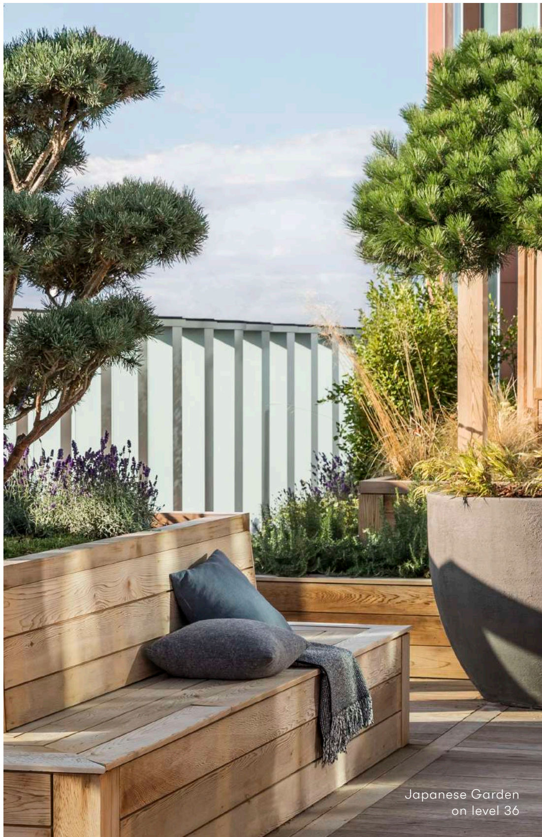
Japanese Garden on level 36